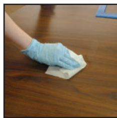
Place wipe, sample side up, on waxed paper.