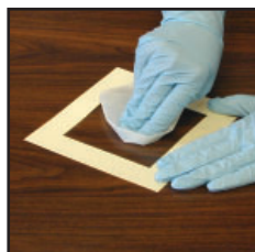
Use a template to specify sample area for samples to be sent to a lab.

Use a new pair of clean gloves for successive wipe samples.