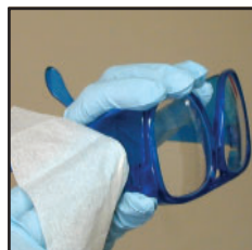
Wipe safety glasses, phones, shoes, etc. thoroughly using one side of wipe.

When taking surface samples that are to be sent to a laboratory for analysis (Lab Analysis Kit) use a template to specify the sample area.