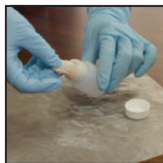
Insert in sample collection bottle and label.