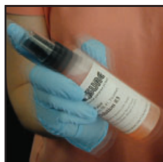
Shake well to mix.