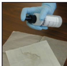
Aim at soiled wipe and depress nozzle 3 times.