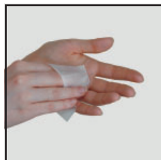
Wipe hands or skin for 30 seconds using one side of wipe.