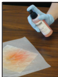
Aim at soiled wipe and depress nozzle 2 times.