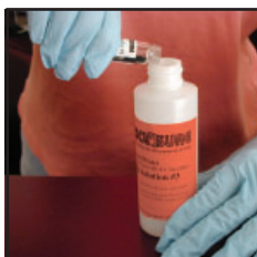
Pour one vial of Disclosing Powder #1 into Developing Solution #3 spray bottle.